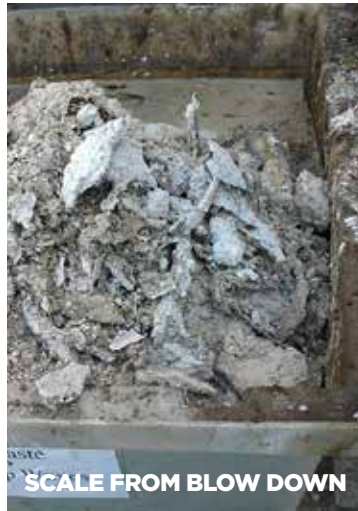
SCALE FROM BLOW DOWN